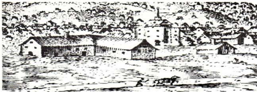
The Curtain Theatre (centre, with flag flying)—from "a view of the Cittie of London from the North", C. 1600.