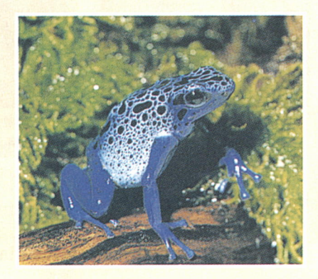
The deadliest animals ... The most poisonous amphibian is the poison dart frog, found in Central and South America. The poison in its skin can kill 20 adult humans.

Wenchuan, China, at an altitude of 5,103 meters (16,730 feet) above sea level, is the world's highest city.