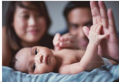
the birth of a baby